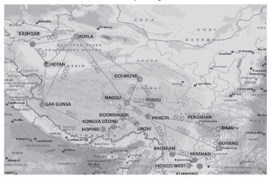
Fig 1: Distances in km between Airfields in Tibet and Adjoining Areas

Note: Distances in km between Airfields in Tibet and adjoining Areas, Author's own. Map not to scale.