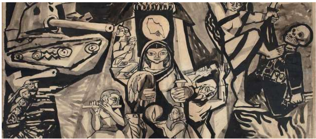
A detail from Chittoprasad Bhattacharya's painting 'Bangladesh War - 1971', featured on the cover of the anthology 'Bangladesh: Writings on 1971, Across Borders'.

'Bangladesh: Writings on 1971, Across Borders', a compelling anthology edited by Rakhshanda Jalil and Debjani Sengupta, brings together literary voices from Bangladesh, Pakistan and India that capture the turbulent period marking the Bangladesh Liberation War 50 years ago.