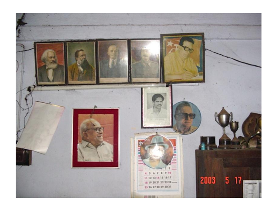
The wall of a CPI(M) office in north Kerala.

Several workers of both groups who became my key interlocutors belonged to so-called backward castes (mostly Thiyya) surviving on living-wage from blue-collar work. In several households, women were the main breadwinners of the families. Some of them worked as anganwadi or health-care workers in state-run facilities. In fact, the women's support and labour made it possible for male members of the household to carry on their political work. It enabled the men to forge their community of comrades. A number of women belonging to CPI (M) and Hindu right-wing affiliated families enjoyed relatively equal access to livelihood and income, but their identities remained subsumed within their families. Such women's participation in public and party-related spaces were mediated by the men in their families.