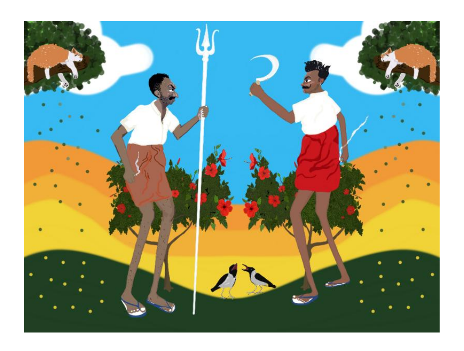
Illustration by Archana Ravi.

1) Your book, looking at political violence between the 'party Left' and 'Hindu right' in Kerala, puts forth a fundamental argument—that democracy as we practice it today breeds its own form of violence. As you note, this runs counter to the popular belief, also supported by certain political philosophies, that by creating at least nominally equal grounds for different groups to compete for power, democracies inherently pave the way for less violent conflict. Can you tell us more about the idea of 'the violence of democracy' that you argue for in the book?