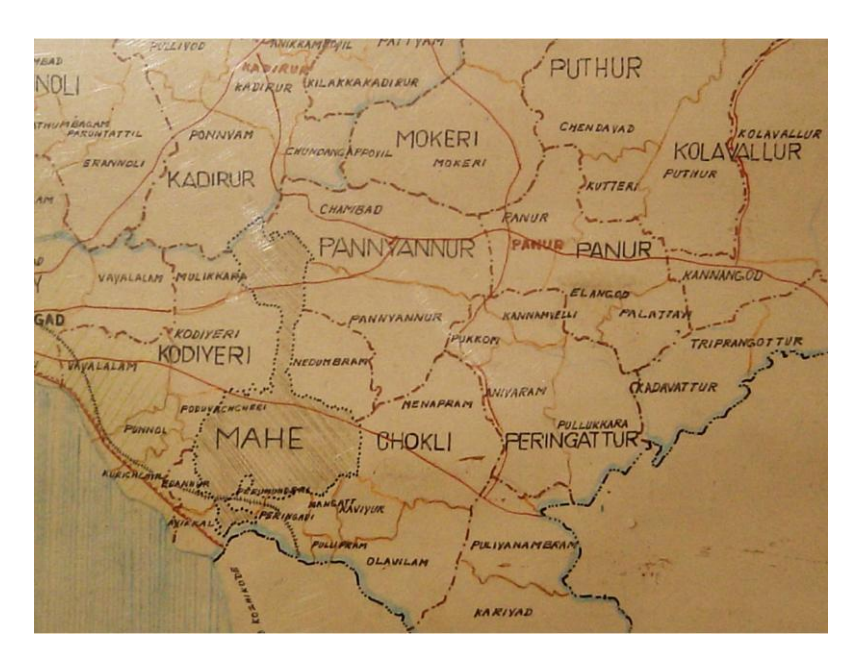
A hand-drawn map of the region in which the author conducted research.

This is a very thought-provoking question that relates closely to the standpoint from which I ended up writing about interparty violence in Kannur. I grew up in north India; carrying out research in Kerala as a north Indian meant that I was always a national insider and a regional outsider. Furthermore, the book was revised and finalised in faraway South Africa. Navigating the insider-outsider status was part of the course while doing my research as it is for many anthropologists and sociologists. Writing about north Kerala in post-apartheid South Africa as it grapples with its own strengths and challenges as a democracy also influenced my perspective.