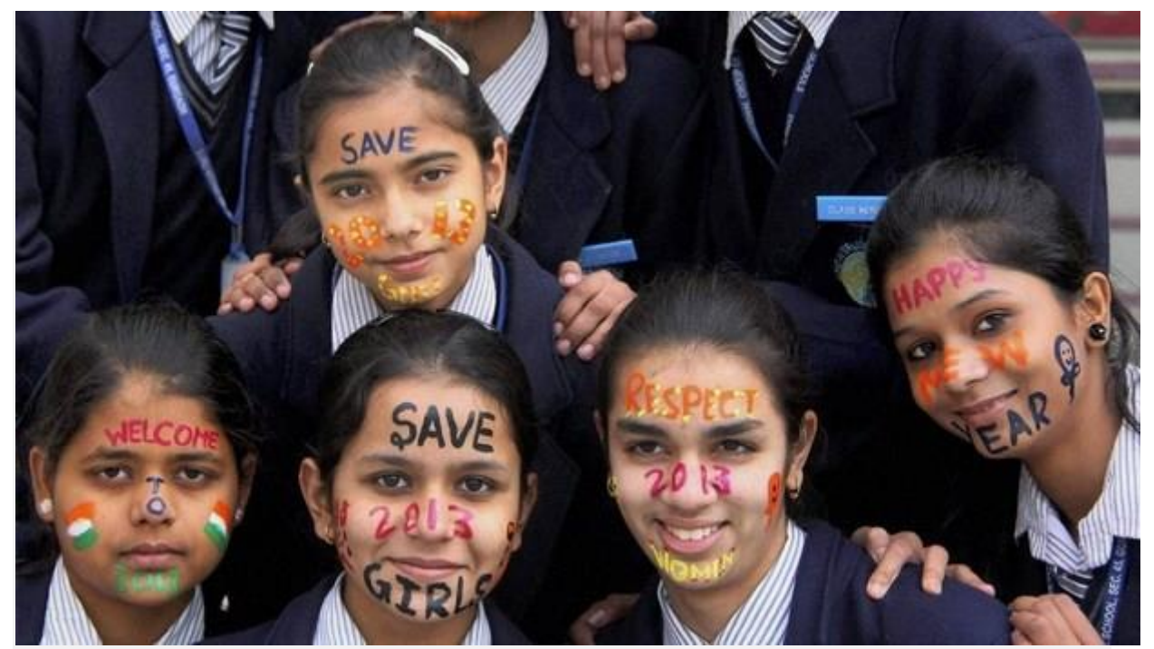
School girls welcoming the new year 2013 with a message 'save girls' in Gurgaon.

A new book edited by Ravinder Kaur examines the consequences of gender imbalances in India and China.